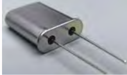
XR-A (HC49) Series

Helping Customers Innovate, Improve & Grow