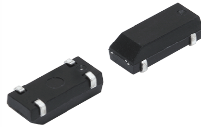
Part Dimensions: 8.0 × 3.8 × 2.5mm • 145.1782mg

RoHS Compliant in Accordance with EU Directive 2011/65/EU